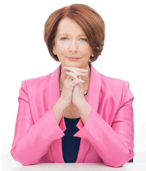
First Female Prime Minister of Australia, Julia Gillard

Tuesday, April 9th | The Lyric Cinema | 6:30pm